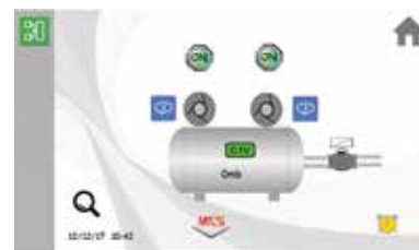
Touch screen view