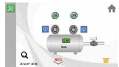
Touch screen view